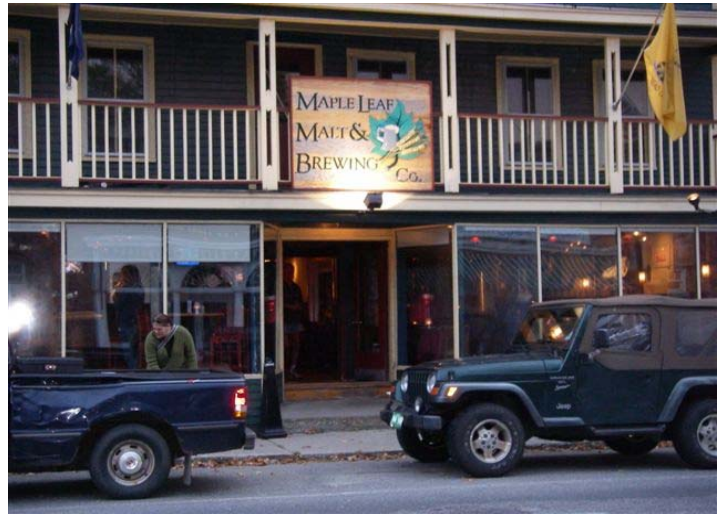
Maple Leaf Malt and Brewing Co.