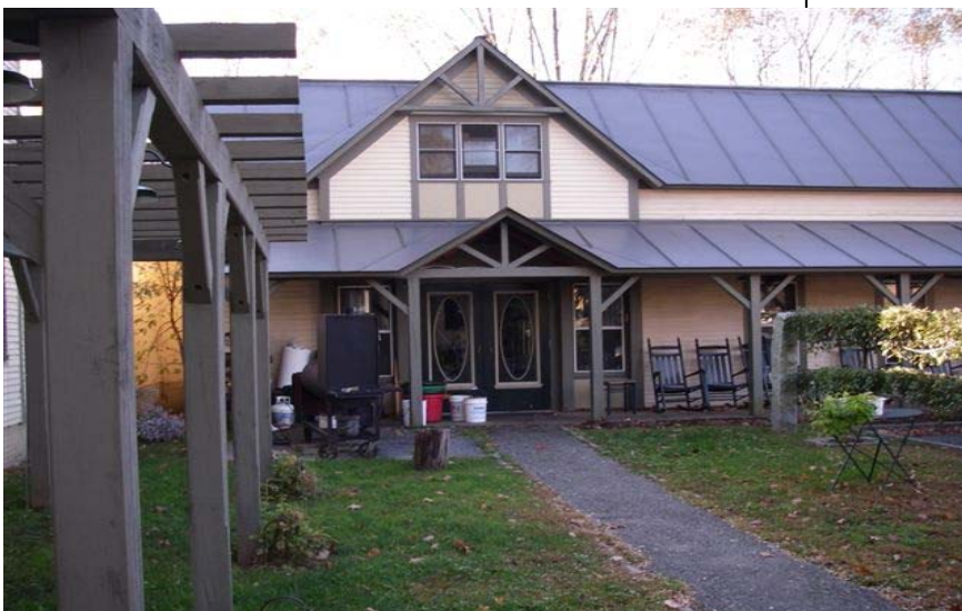
Brewhouse at Norwich Inn