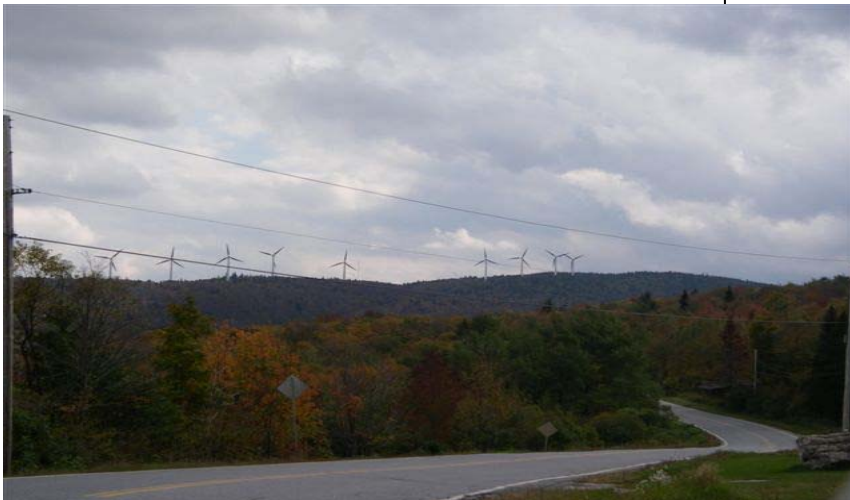
Wind Turbines at Searsburg